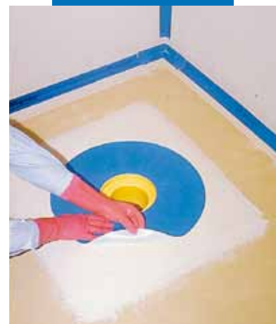
Positioning the special piece of Mapeband over Mapegum WPS

Mapegum WPS is available in 5, 10 and 25 kg drums.