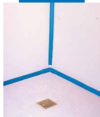
End result of a waterproofing treatment using Mapegum WPS and Mapeband