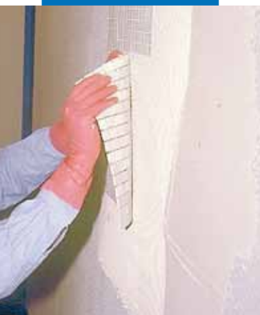
Laying glass mosaic